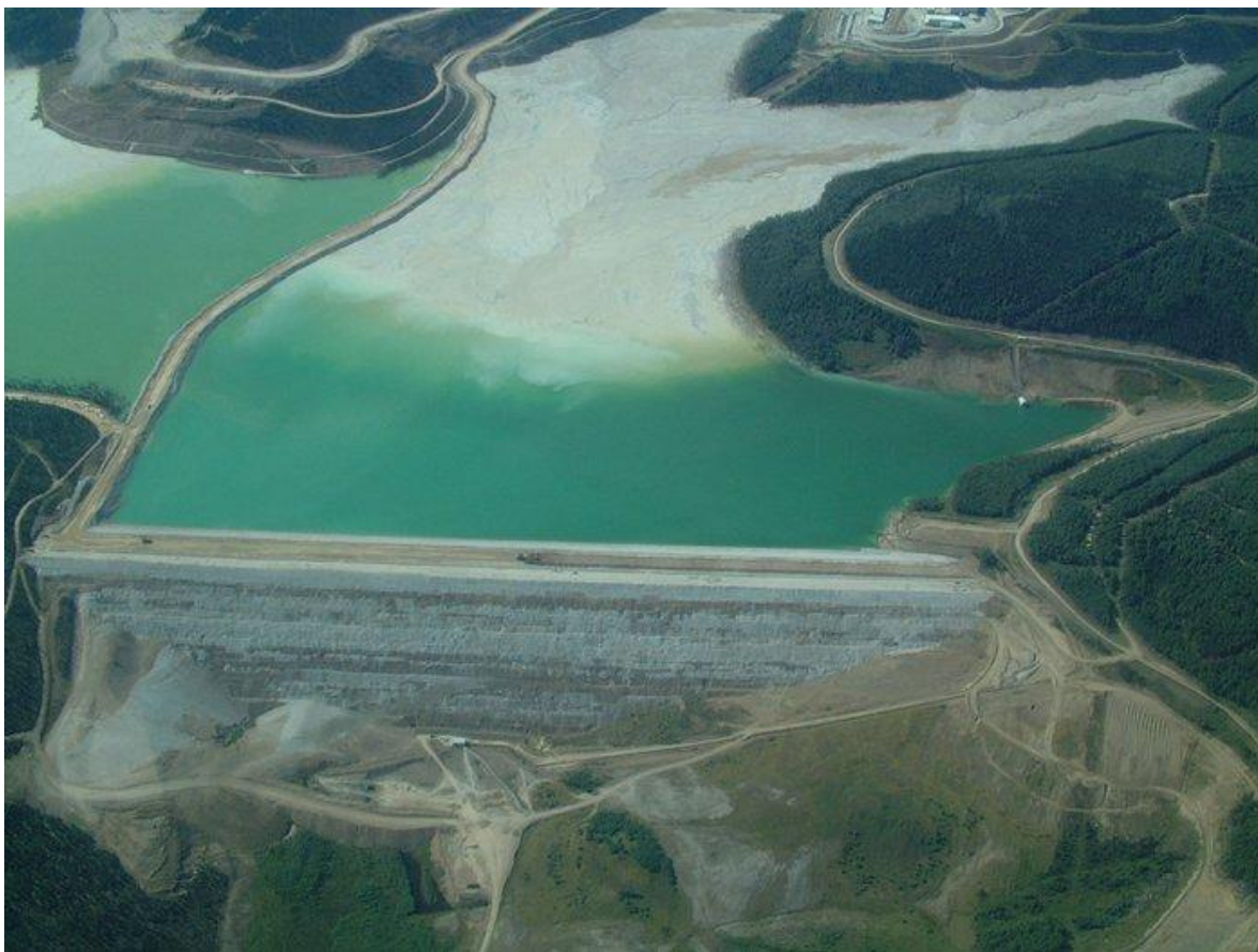
TYPICAL MINE TAILINGS DAM —

This tailings impoundment dam at the Fort Knox gold mine (/Issues/MetalsMining/FortKnoxMine.html) in Alaska is a common method of storing mining waste forever (/Issues/OtherIssues/InPerpetuity.html) .