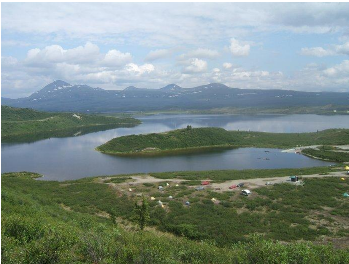
TANGLE LAKES RECREATION — A Recreation Area at Tangle Lakes — Get Photo ( /photos/tangle-lakes-recreation/ )