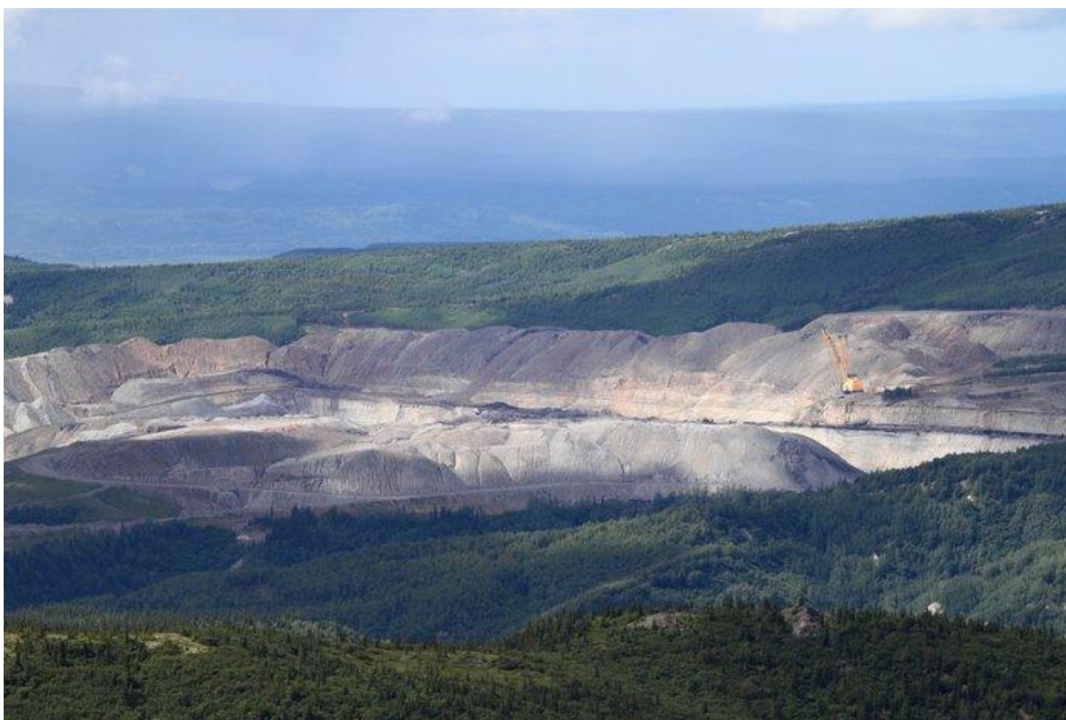
TWO BULL RIDGE COAL MINE — This photo is taken from the ridge across Lignite Creek looking north to the mine, and shows most of the area of active mining. The giant