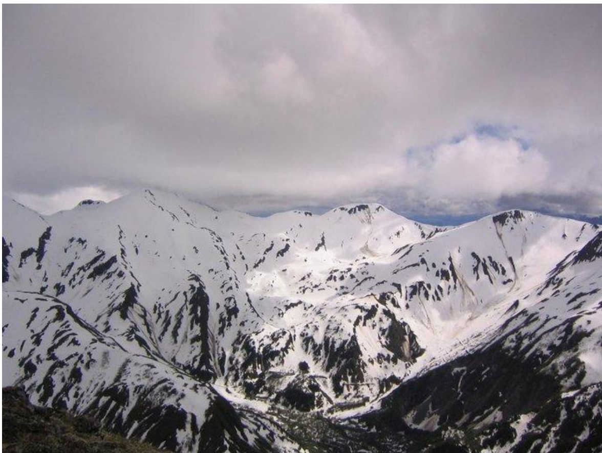
AJ “GLORY HOLE” — “Glory Hole” left over from historical mining in the area — Get Photo (/photos/aj-glory-hole/)

The Alaska Juneau Gold Mining Company began operations near Juneau in 1912, and the AJ mill itself began operation in 1917. In the 1930’s the AJ mine employed around 1000 people ( http://www.juneau.org/engineering/AJ_MINE/documents/AJMineHistory_Condensed.pdf ), produced 12,000 tons of ore per day and operated 24 hours a day, 363 days a year. The mine continued operation until it was closed by federal order in 1944 since gold was considered non-essential for the war effort. In total, around 90 million tons of ore were mined, producing millions of ounces of gold.