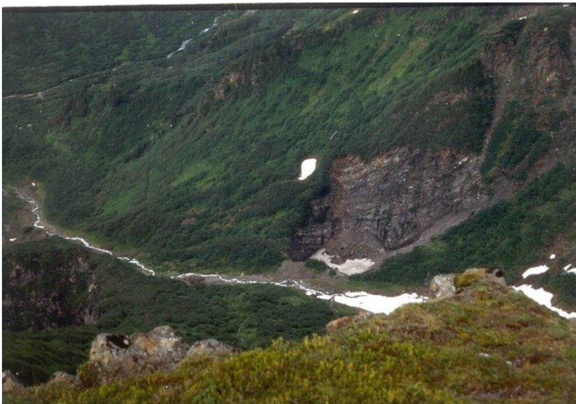
GOLD CREEK — Water quality at Gold Creek is one of the major issues about re-opening the AJ mine — Get Photo ( /photos/gold-creek/ )

AEL&P has stated that there is currently no surplus power available for a mine. The mine facility would have to generate power (/Issues/MetalsMining/Powering-Large-Mines-In-Alaska.html) on-site, from diesel, or potentially from natural gas. AEL&P has also raised the possibility (http://juneauempire.com/stories/022411/loc_790464502.shtml) of having the mine operator partner with AEL&P to expand the Lake Dorothy hydropower project (http://www.aelp.com/Lake%20Dorothy/lakedorothy.htm) .