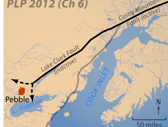
Figure 1: PLP (2012 Ch 6) concludes that the Lake Clark Fault is inactive, and veers away from the mine site. This conclusion is not supported by either PLP's work, or existing literature - the fault's location near Pebble, and its activity, are unknown.