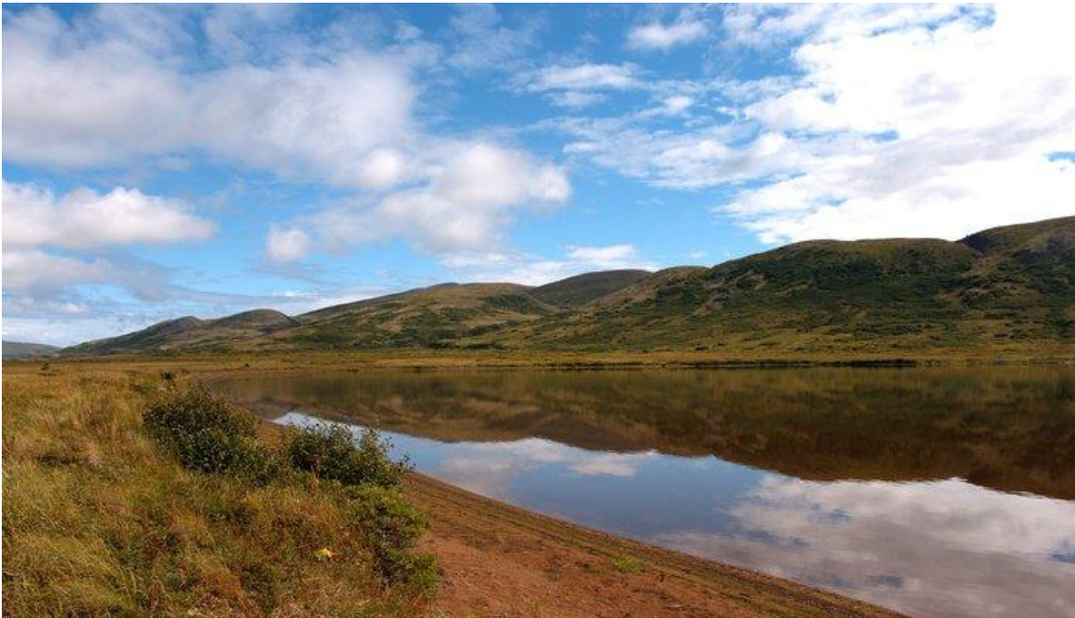
FRYING PAN LAKE — North end of Frying Pan Lake. — Get Photo (/photos/frying-pan-lake_3/)

Northern Dynasty maintains that it has a “no net loss” policy ( http://www.minesandcommunities.org/article.php?a=2953 ) for fisheries in the area which would mean that any loss of productivity would be theoretically compensated for in some other way. These direct effects that Pebble would seek to mitigate include destruction of salmon spawning habitat near the mine, an increase in “total dissolved solids” ( http://en.wikipedia.org/wiki/Total_dissolved_solids ) downstream of the mine, and the release of metal compounds that can interfere with the homing mechanism ( http://pebblescience.org/pdfs/Pebble_copper_salmon.pdf ) of salmon. A similar policy is in effect in Canada, where it includes actions such as attempting to create new habitat near the habitat that was destroyed, or simply paying a lump sum to the government to compensate for