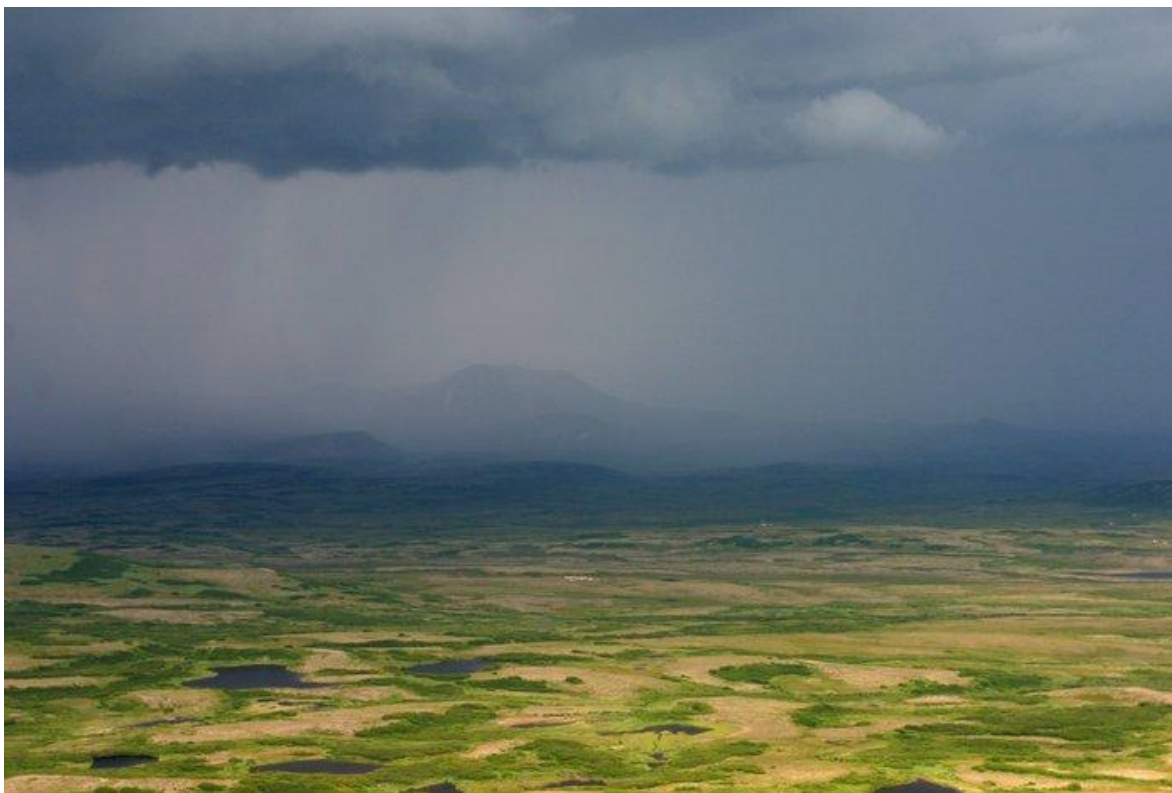
GROUNDHOG MOUNTAIN THUNDERSTORM — Thunderstorm approaching from Groundhog Mtn, within the Groundhog mining claims — Get Photo ( /photos/groundhog-mountain-thunderstorm/ )