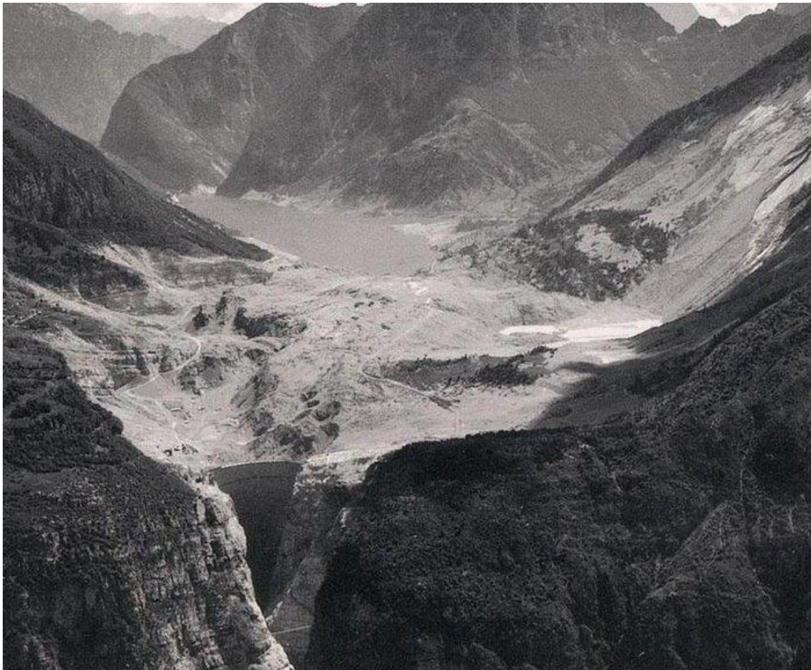
VAJONT DAM AFTER THE LANDSLIDE — Vajont's reservoir was mostly displaced by a massive landslide, creating a wave that crested 500 feet over the dam's rim. The dam

& Ghirotti's "The 1963 Vajont Landslide" ( http://www.vajont.info/gGeoAppl.pdf ) and Marco's "Decision-Making Errors and Socio-Political Disputes over the Vajont Dam Disaster" ( http://www.academia.edu/1941240/Decision_making_errors_and_socio-political_disputes_over_the_Vajont_dam_disaster ), and lightly from the history presented in Risky Ground. ( http://www.sfu.ca/cnhr/newsletters/RiskyGround_News_2013-09-21.pdf )