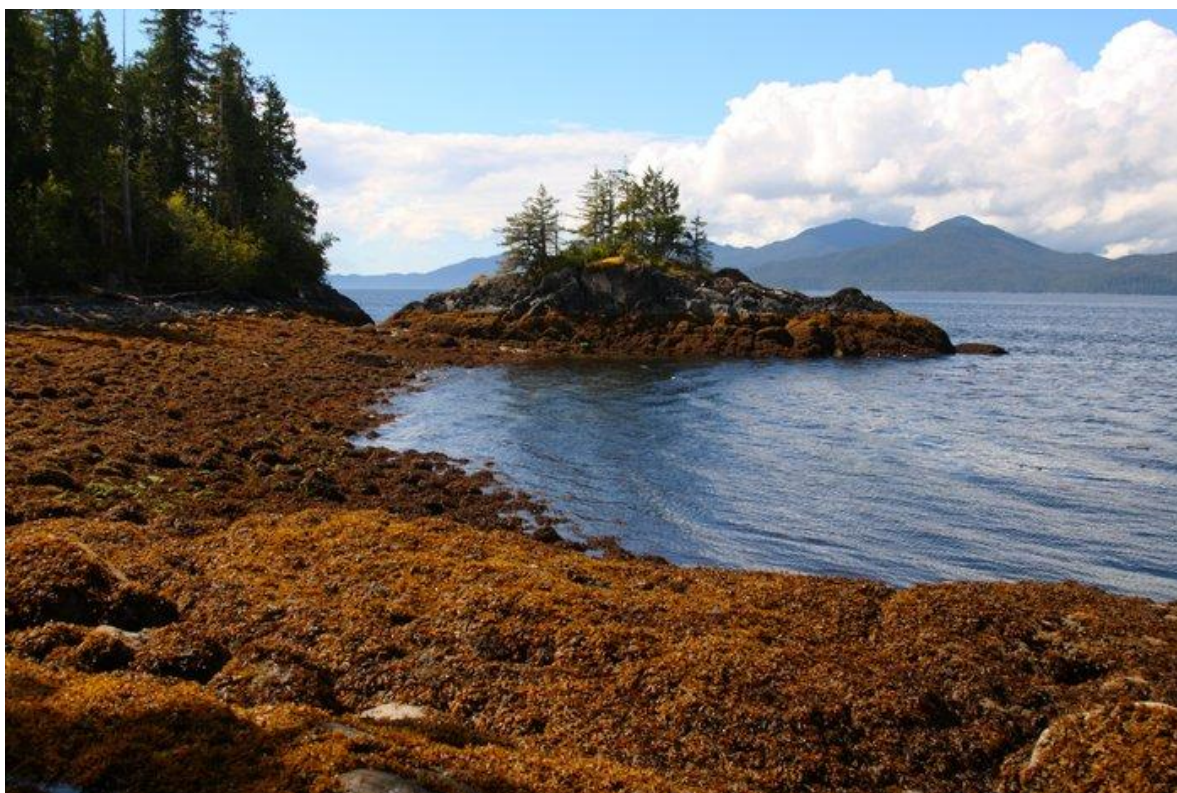
BEACH ON DOUGLAS CHANNEL — Seaweed covered rocks along Douglas Channel not far from the proposed pipeline route. — Get Photo ( /photos/beach-on-douglas-channel/ )

AlaskaOilandGas/OilDegradation.html ) more slowly in cold water, and could persist for decades in places like Caamano and Wright Sound. A large increase in oil tanker traffic in Caamano Sound resulting from the existence of the Northern Gateway pipeline would raise the risk of having a major spill in the area.