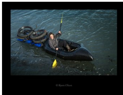
Alpaca Gnu and trailer