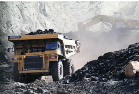
Machinery pulls coal out of Two Bull Ridge coal mine.

We watched machinery pull coal out of Two Bull Ridge mine during a tour after our trek.