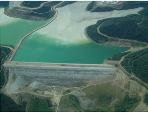
Earthen tailings impoundment dam at Fort Knox gold mine in Alaska

thousands of years, failure by some cause is nearly inevitable.