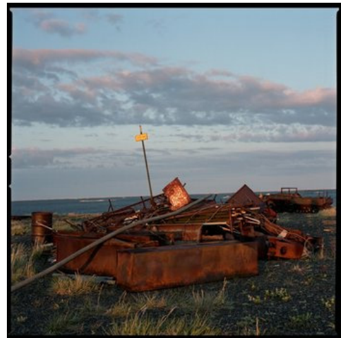
Remains of Project Chariot site, Spring 2009