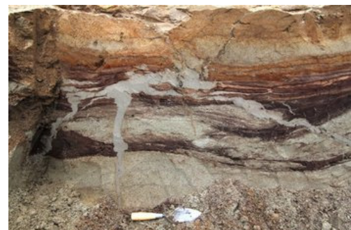
Muddy sand forced its way up through this peaty soil.