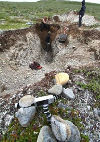
Photos taken while digging a large trench through a possible active fault near Lake Iliamna.

Ground Truth Trekking has focused both on field research and on analysis and critique of PLP's work. We have surveyed key sites around Lake Iliamna near Pebble, and we are currently preparing to submit our field results, which present evidence of past earthquakes in the area, for peer review. In analyzing PLP's work, we released a letter to DNR in 2008 and a detailed critique of PLP's hazard assessment in 2012.