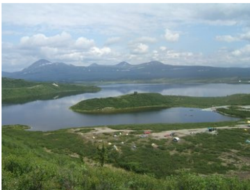
A Recreation Area at Tangle Lakes