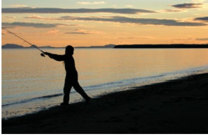
Fishing on Bristol Bay

Salmon need undammed rivers and streams, unpolluted, surrounded by healthy forests, and a healthy ocean to end up in. This makes the wild salmon fishery a natural ally of environmentalists who want to preserve not just salmon, but entire ecosystems.