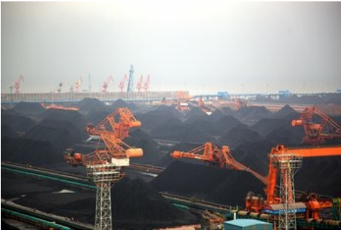
Coal bulker terminal at Quinhuangdao China.