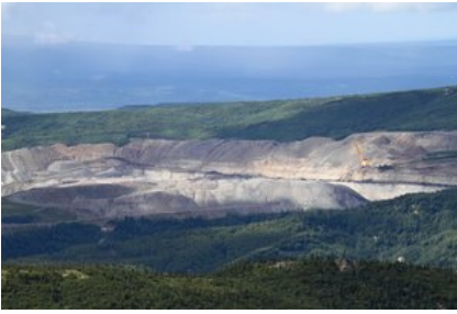
This is the most active of the Usibelli coal mines.

Most coal mining in the U.S. is surface mining, which includes strip mining and mountaintop removal. In surface mines, the original ecosystem at the mine site is destroyed in the process of removing the coal. Coal companies are required to plant vegetation to reclaim the site after mining , restoring the original ecosystem may be difficult, particularly in wetlands areas. Mining destroys fish and wildlife habitat, which has rippling effects not only on their populations, but on the human residents that rely on them.