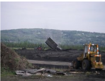
UAF disposal site for CCW

Coal combustion wastes (CCW) include ash, sludge, and boiler slag left over from burning coal to make electricity. These wastes (120 million tons/year in the US) concentrate toxins such as arsenic, mercury, chromium, cadmium, uranium and thorium. In addition, these wastes create an expensive storage problem " in perpetuity ". Coal combustion emissions released into the atmosphere contain nitrous oxides which are responsible for industrial and urban smog, sulfur dioxide which is the primary reactive agent behind acid rain, mercury which accumulates in the food chain, and large amounts of carbon dioxide which is the most important greenhouse gas contributing to climate change. Coal mining itself also releases significant amounts of methane, another extremely potent greenhouse gas. Coal mining is responsible for over 25% (2.1 MB) of the energy-related methane emissions in the US.