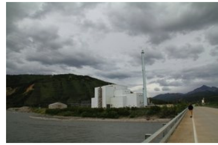
The HCCP plant near Usibelli coal mine

Taxpayers also pay the costs of cleaning up environmental disasters caused by the coal industry. Cleanup of the recent coal ash spill in Tennessee is estimated to cost up to $1 billion, not including pending litigation . Now that the cleanup at this site has been taken over by the EPA under the Superfund law, most of this cost will be borne by the US taxpayer.